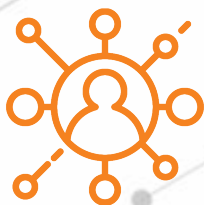
SOCIAL OUTREACH PROGRAM