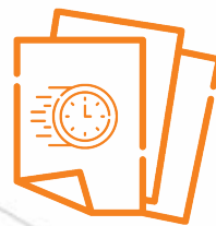
SHORT TERM COURSES