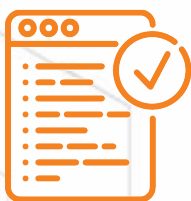
TAILOR MADE PROGRAMS