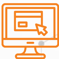
INDUSTRY AND ACADEMIA INTERFACE