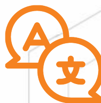
CENTRE FOR FOREIGN LANGUAGES